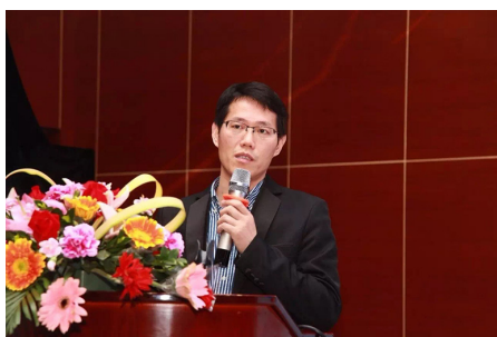
Figure 19 Prof. Xuchao Zhang (Guangdong Lung Cancer Study center) is introducing “Application of Gene Detection in the Treatment of Lung Cancer”.