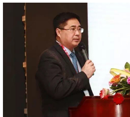
Figure 10 Prof. Zhentao Yu (Department of Esophageal Cancer, Tianjin Medical University Cancer Institute & Hospital) is introducing “Adjuvant Therapy for Esophageal Cancer during Perioperative Period”.