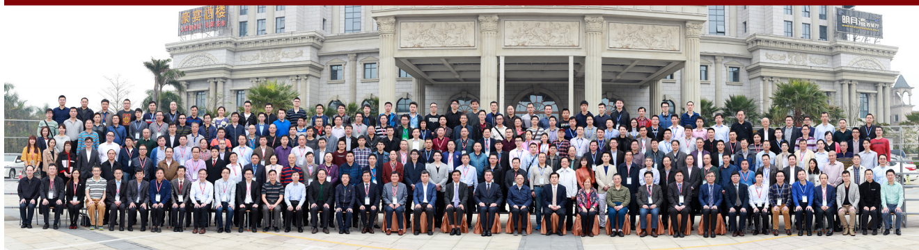
Figure 21 Participants group photo.