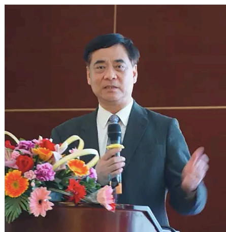
Figure 6 Prof. Gang Chen.