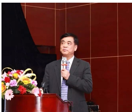
Figure 13 Prof. Gang Chen (Department of Thoracic Surgery, Guangdong General Hospital) is introducing “Total Thoracoscopic Pneumonectomy”.