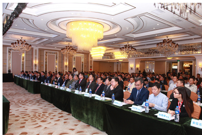
Figure 20 Audiences at the corner of the venue.