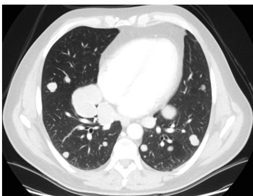
Figure 1 Multiple, bilateral lung metastases not amenable of radical resection because of number, location and dimensions of the lesions.