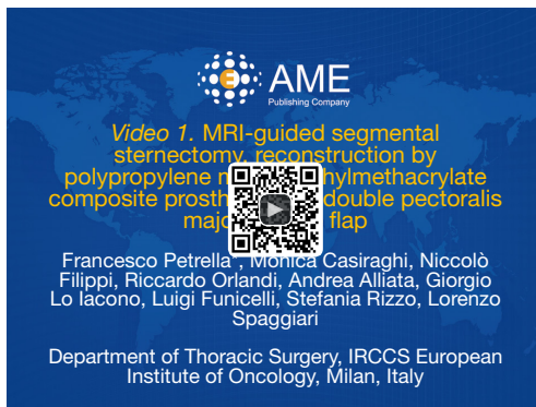
Figure 4 MRI-guided segmental sternectomy, reconstruction by polypropylene mesh/methylmethacrylate composite prosthesis and double pectoralis major muscle flap (6).

Available online: http://www.asvide.com/watch/33069