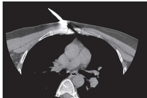
Figure 3 CT-guided biopsy attempt, without any histologic results.

On the contrary, complete intraosseous sternal lesion, not visible by CT scan, may represent a further challenge and MRI guide represents the ideal tool for an effective and