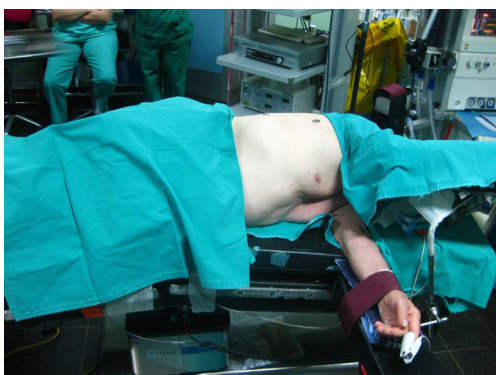
Figure 1 Positioning.