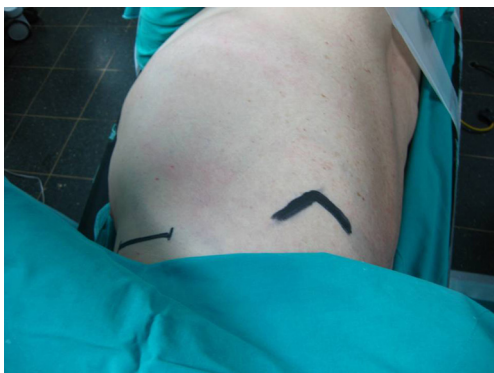
Figure 3 Axillary mini-thoracotomy.