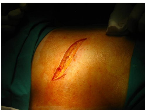
Figure 2 Skin incision.

from the brachial plexus. In order to keep the cervical in a neutral position, head must be supported with a pad ( Figure 1 ).