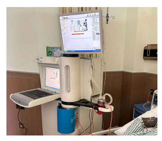
Figure $1 BR-TRG-I body cavity thermal perfusion therapy system equipment.